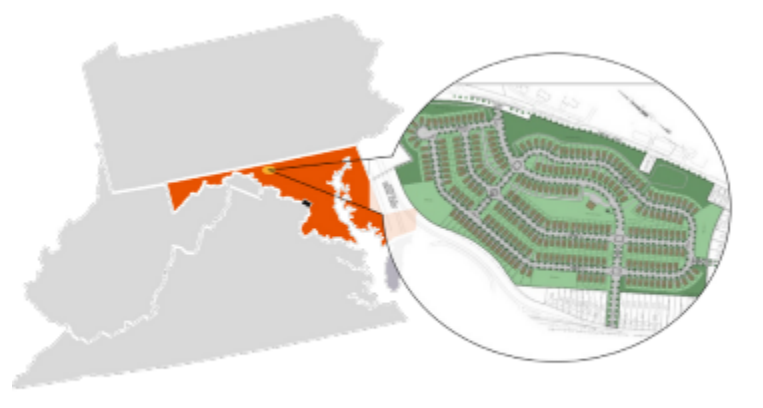
Site Location and Aerial View

For the DC area showcase pilot, we focused on a development in Hagerstown, a city in Maryland with significant job growth in the warehouse and distribution sectors whose workforce is being shut out of the housing market. We connected the developer with a Fannie Mae seller servicer with the intent of supporting the development of an MH Advantage community. The planned subdivision will be a subdivision of 241 MH Advantage homes within the city limits of Hagerstown, Maryland. The pricing for these homes will range between $181,000 (2BR) and $223,000 (4BR), and the homes will be marketed to first-time homebuyers with incomes at 80-120% of the Area Median Income. Kilpatrick Woods will fill that gap with quality affordable manufactured homes for moderate-income individuals and families. This subdivision is in the planning stages; however, the developer is still seeking funding to construct.